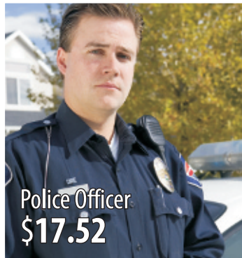
Police Officer $17.52