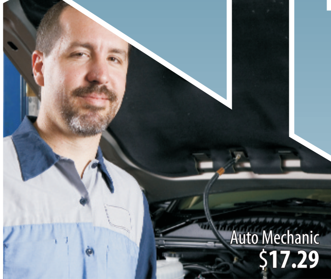
Auto Mechanic $17.29