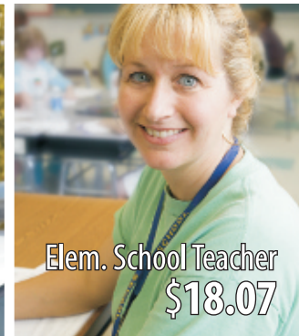
Elem. School Teacher $18.07