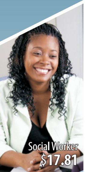
Social Worker $17.81